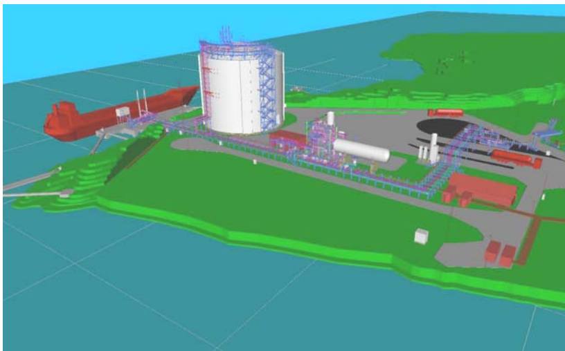
Fig. 4. Visualization of LNG terminal in Nynäshamn [20]

It is expected that the terminal will be complete by May 2011. The estimated cost of terminal and tank is 275 million SEK [16].