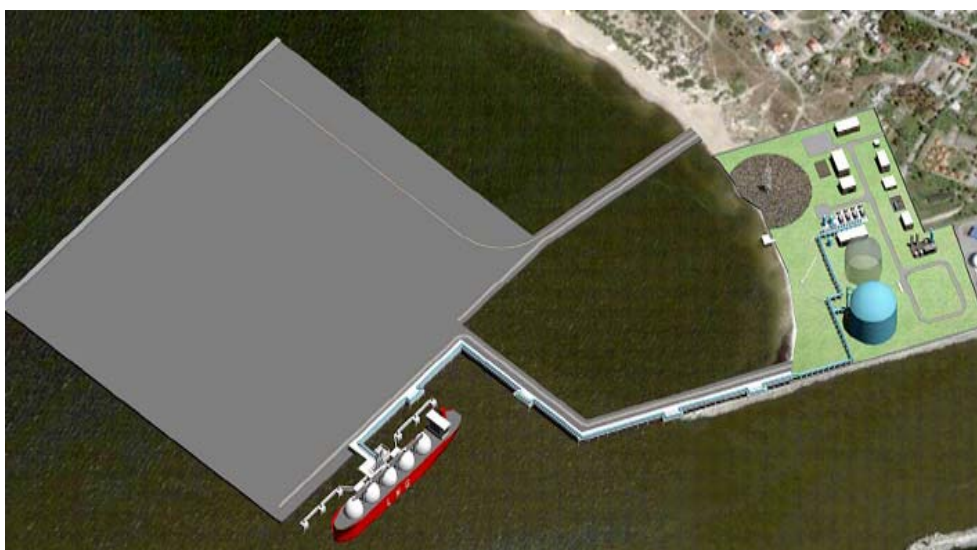
Fig. 3. Visualization of LNG terminal in Klaipeda [19]