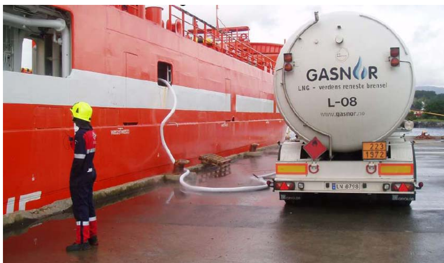
Fig. 5. Bunkering of the vessel from tanker truck [2]