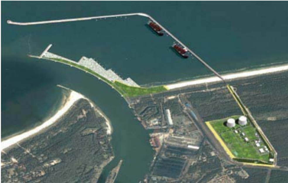
Fig. 2. Visualization of LNG terminal in Świnoujście [10]

Whole project is financed by state or state owned companies. The cost of the construction of LNG terminal is estimated at 2 946 559 860 PLN brutto (2 415 213 000 PLN netto) [15]. The cost of the breakwater construction and dredging works are estimated at 814 million PLN. The cost of constructing the port jetty is estimated at 167 million PLN [18]. The LNG terminal is expected to be put into operation in 2014.