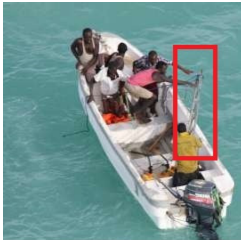
Fig. 2. Detected pirates throwing ladders overboard

“The frigate “NIEDERSACHSEN” was on patrol off the Somali coast near a suspected pirate camp. Parallel to this patrol, the helicopter Sea Lynx was airborne for reconnaissance and spotted a suspicious boat. It was a so-called “whaler” (small boat) towing a skiff behind it. It was evident that no fishing gear was on board, but ladders and several drums were carried. Since the evidence of piracy hardened, the frigate approached the coastline up to one nautical mile and prepared for boarding. The German boarding team in their rigid-hulled inflatable boat (RHIB) approached the suspicious small boat with the suspected pirates on board. The vehicle should be stopped and checked. During the approach, the suspects threw several ladders overboard. Additionally, some of them jumped overboard and swam ashore in order to avoid being captured.”