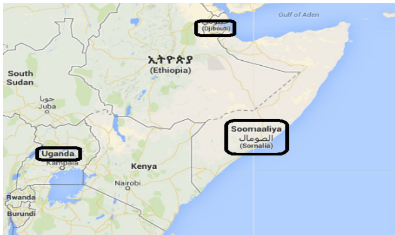
Fig. 1. Somalia, Djibouti, Uganda and the Horn of Africa

The international community has shown that it can provide maximum protection from pirate attacks, with a coordinated use of available units, i.e. ships and aircraft, for monitoring the Gulf of Aden and the Somali Basin. Obviously, with more ships and more aircraft an even greater coverage can be achieved. In the past almost six years, the external conditions, the threats and the rules of engagement for the units involved have gradually changed.