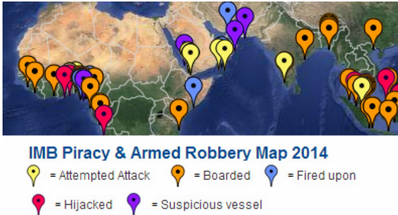
Fig. 4. Piracy Activity (reported) 2014, shown from West Africa to Southeast Asia

“Unlike pirates along Somalia’s coast, who are often only after ransom, pirates in West Africa also steal goods, particularly oil. Many attacks end up with crew members injured or killed” 9 .